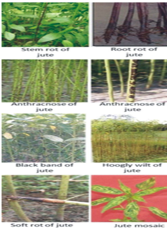
Fig.1: Major diseases of Jute