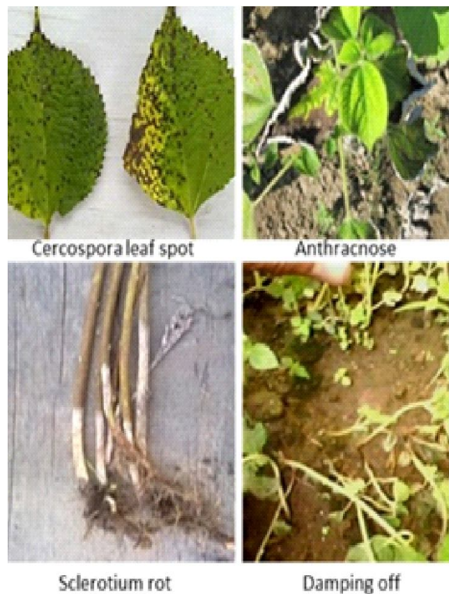
Fig. 4 : Important diseases of Ramie