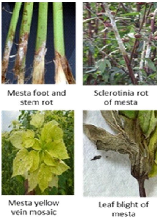
Fig. 2 : Major Diseases of Mesta